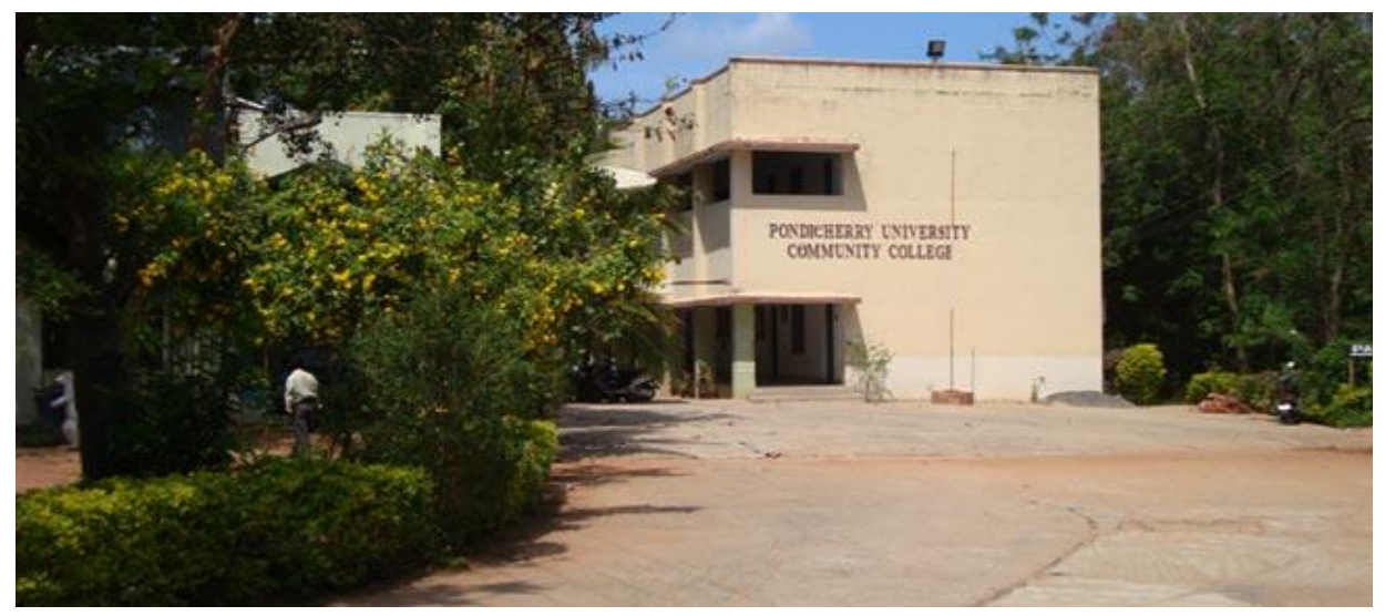
Figure 3. Pondicherry University Community College. Main Building of the College.

At the narrow gate of the Pondicherry University CC, there was a security guard who knew Hindi and guided us towards the principal's office. We had to wait for almost two hours to meet the principal. The wait time gave me a chance to explore the setting of the college. Plants and trees and a public playground surrounded the rectangular two-floored building of the CC. The first office on the right hand side of the entrance was the principal's office. Further down the hallway was a staircase that led to the first floor. On our way, we passed the staff room and a library.