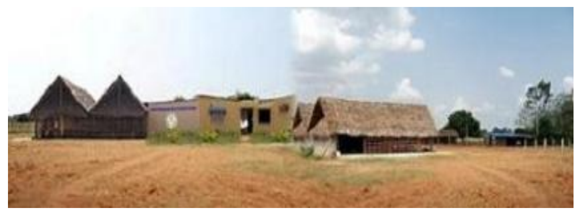
Figure 4. Shed of Britto Community College . A picture of the shed where Britto Community College was established in 2008.

The villagers helped the couple to build the shed. It was made out of hay and was used as a low cost sustainable option. The college was in operation for six years under this roof. To the villagers, the establishment of the CC seemed like a miracle. The vision, courage, and determination of the couple made this miracle possible for the villagers.