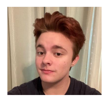
Figure 12 . Three years on testosterone