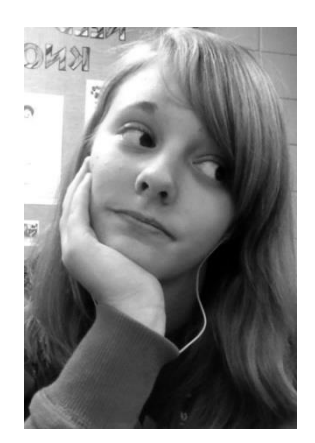
Figure 1 . 27 October 2014

"I researched and researched for months, going back and forth trying to convince myself that I was transgender and that I wasn't transgender."