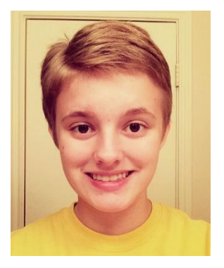
Figure 5 . 18 June 2015

For the remainder of the conference, I used the handicap bathroom. This was an entirely different kind of uncomfortable because what kind of physically able 15-year-old kid would need to use the handicap? I stressed the entire time I was in there, imagining some sad, old lady in a wheelchair patiently waiting her turn. "Sorry! I'm a gender enigma and don't want to be picked on by 12-year-old girls!" I could have been much less fortunate, however; transgender people are physically abused and traumatized in bathrooms constantly, and my fear was being the subject of gossip.