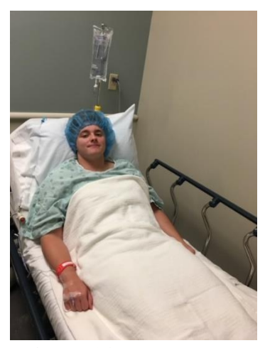
Figure 14 . 18 June 2019

After securing a date, the office sent us a laundry list of things we needed we needed to buy for both before and after surgery. For before surgery, I needed to take Vitamin C every day and wash my upper body with Betadine from neck to naval beginning a week before my surgery. I also wasn't allowed to eat or drink anything after midnight the night before, and since my operation was at 10:00am, I went about twelve hours without eating or drinking anything (including water). They even specified that when I brush my teeth the morning of, I should rinse my mouth but not swallow. For after surgery, I needed to buy maxi-pads and Vaseline (read on to find out why!), and we were provided with gauze, silicone medical tape, and medicine to help with the pain. On the day of my surgery, I was required to wear loose clothing, a shirt that buttons up, and flat shoes; so, I went with sweatpants, a flannel, and my old Sperry's that my dog chewed off the laces from and I just wore as house shoes. I also wore a binder under my flannel right up until I had to take it off to put on the hospital gown and compression socks. That was the last time I ever wore a binder.