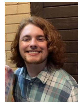
Figure 13 . Four years on testosterone