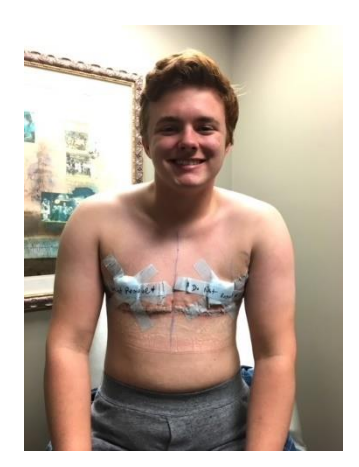
Figure 15 . 19 June 2019

them tomorrow and wrap me in new ace bandages that are much looser. I'm feeling pretty upbeat now that I've had the chance to relieve some pain and I'm looking forward to seeing my scars tomorrow before they get rewrapped."