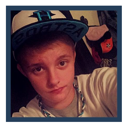
Figure 6. 2 August 2015

mom into the women's bathroom, and as I was washing my hands, a woman approached me saying "sweetie, I think you're in the wrong bathroom". I told her I wasn't, but the thing was... I was in the wrong bathroom.