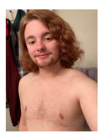
Figure 18 . 21 June 2021

legal documents changed before I get my teaching certification, so it's currently in the works. Soon, it will become something that will affect my life; but for now, I'm extremely happy with the progress I've made in my transition.