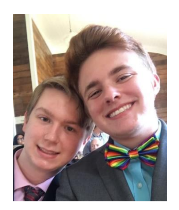
Figure 11 . Two years on testosterone