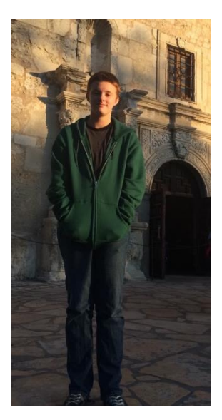
Figure 4 . 16 January 2016

backyard to call my friend and tell her that everything was fine, but that I was terrified of what could happen next.