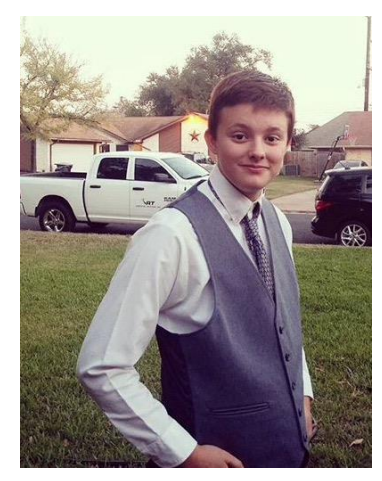
Figure 3 . 18 October 2015

How did I know? That is an excellent question. How do you know you are who you are? When you're cisgender—meaning you identify with the sex you were assigned at birth—you don't really have any second thought about your gender. For some trans people, you can tell very early on in childhood that something is off. For others, you don't make that realization until you have one foot in the grave. It's different for everyone. I knew because I always felt more euphoric and part of the group around other boys when I was younger; I was more comfortable in masculine clothing; being called a "girl" just felt so... embarrassing. Not because I thought girls were any lesser than boys, but because I had so little in common with the other girls in elementary and middle school that I always felt out of place and being included in the addressment of "girls", "daughters", and "ladies" made me cringe.