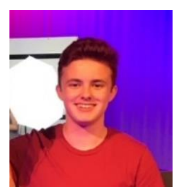
Figure 10 . One year on testosterone