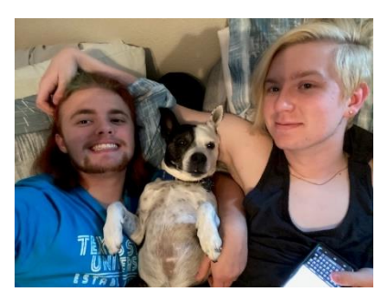
Figure 20. 4 August 2021

with two other roommates. Now, we live alone in an apartment with my dog, and I couldn't be happier.