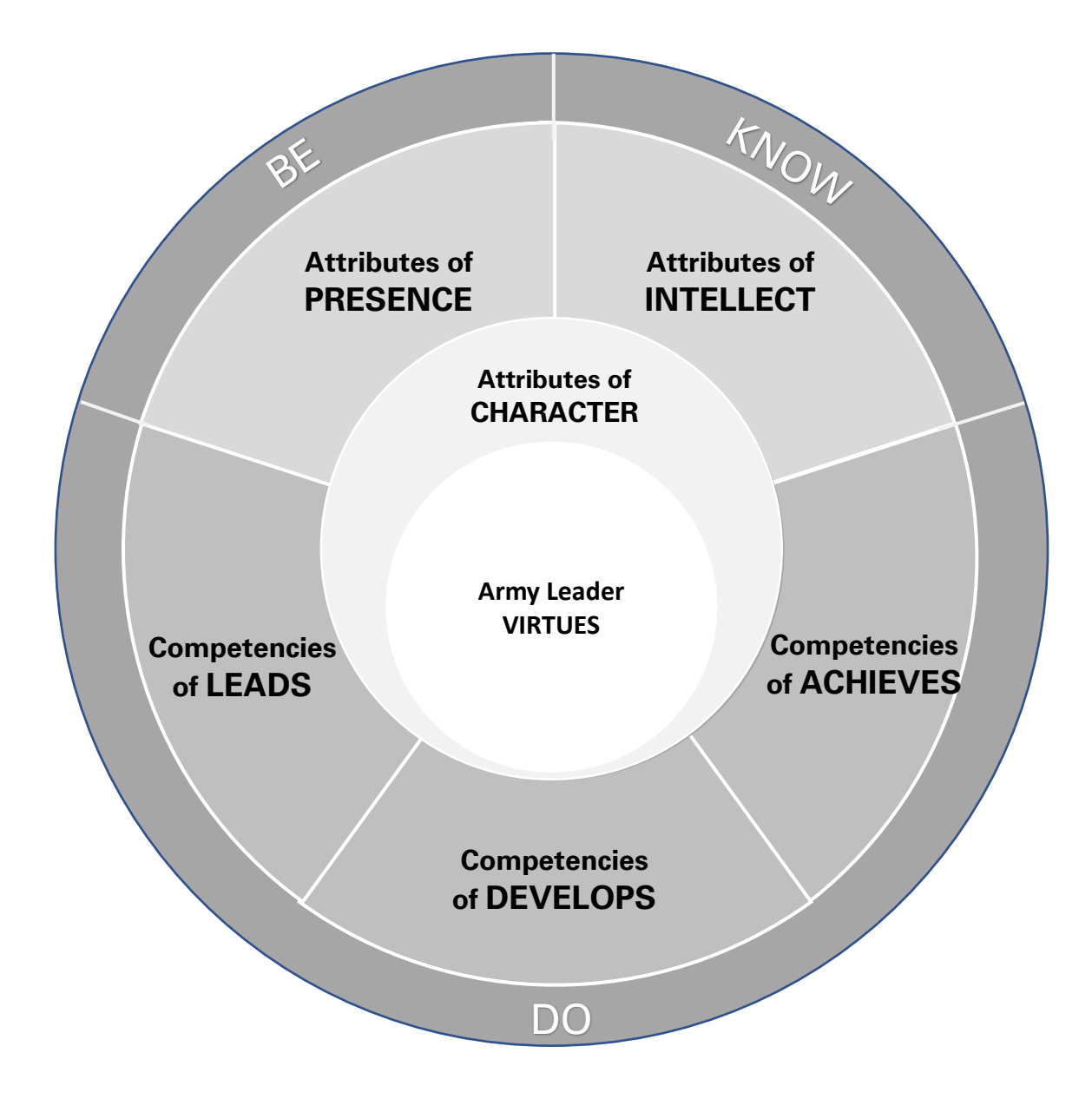
Figure 2. Revised ALRM Centered in the Army Leader Virtues (ALV)