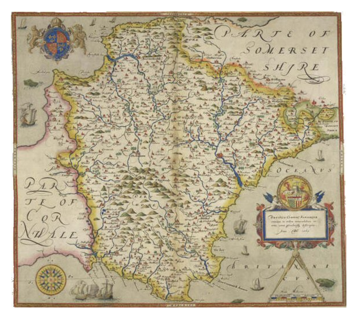
Figure 2.1. Map of Devon, 1579. This map was drawn by Christopher Saxton as part of the Atlas of the Counties of England and Wales . It is found in The British Library, Maps.C.3.bb.5 f10.