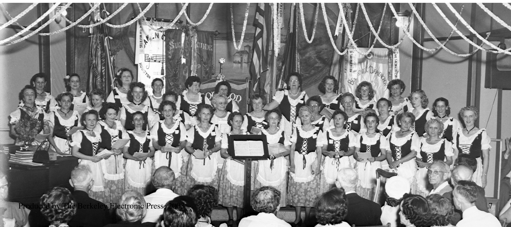
Photo of Beethoven Damenchor Austin, Texas, 1952.