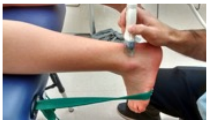
Figure 1 . Cross sectional MSK imaging of the Achilles tendon. Musculoskeletal ultrasound imaging was performed with the ankle the anatomical position 0°. The ultrasound transducer was placed directly between the medial and lateral malleoli. Similar methods were used for each Achilles tendon CSA image recorded.

Participants reported for baseline MSK ultrasound imaging the last week of August, two weeks before their first official race. For every image, participants did not run for at least 4 hours prior to the image being taken, but had run within 24 hours of the image. Images were usually taken before practice and were performed at a similar time of day. The participant would lay prone on a treatment table with their ankle positioned at the anatomical position 0°, measure by a goniometer. A strap was connected to the end of the table in which the participant would rest their foot against. The clinician placed ultrasound transmission gel on the ultrasound transmission head and placed the 12 MHz linear ultrasound probe at the midpoint between the medial and lateral malleoli (Figure 1).