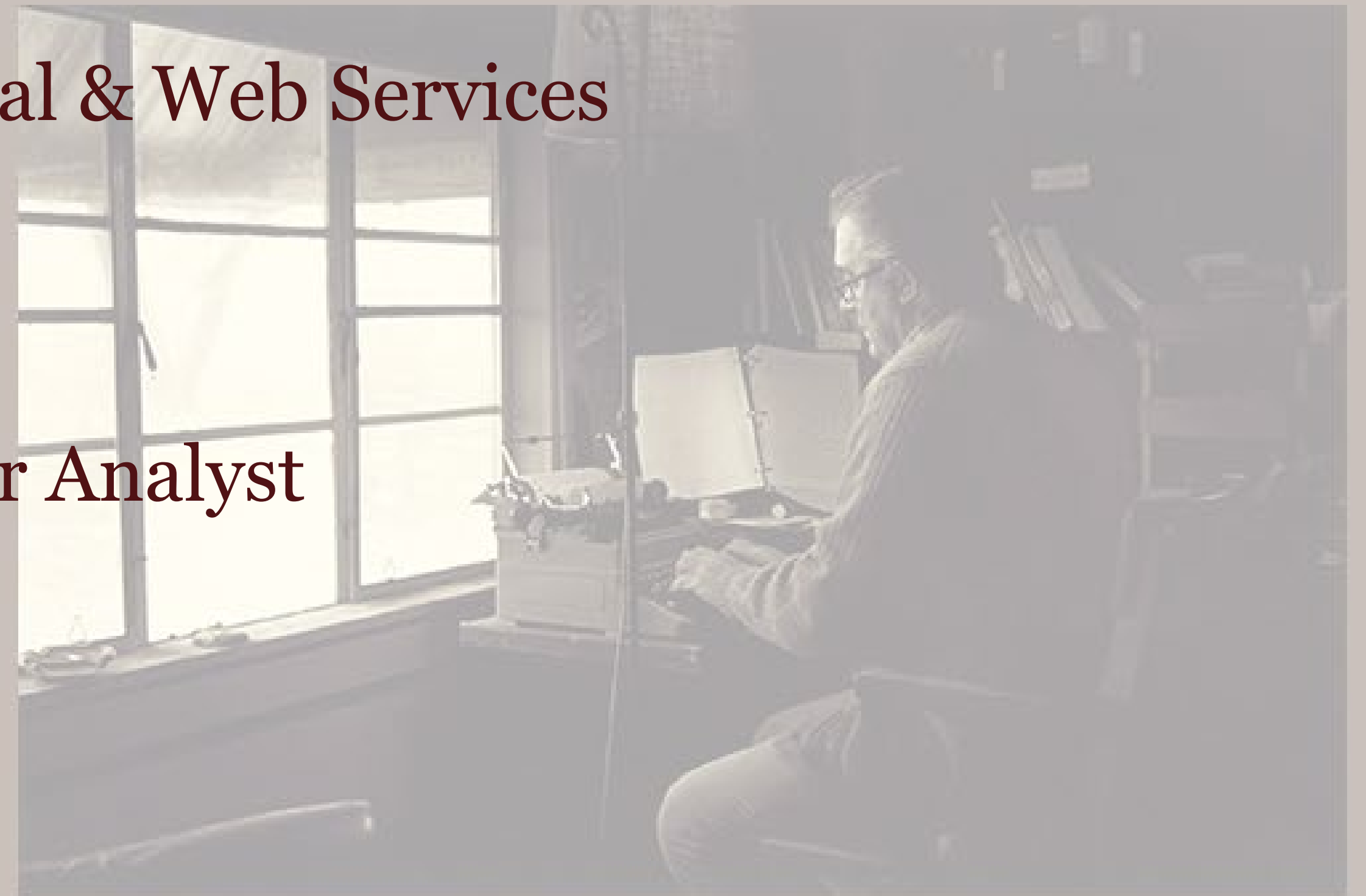
THE WITTLIFF COLLECTIONS