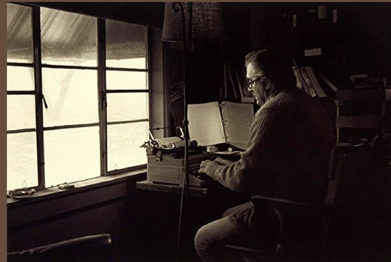
THE WITTLIFF COLLECTIONS

The Digital Collections repository provides access to digitized materials from The Wittliff Collections, the University Archives, and other materials unique to Texas State University. There are additional online exhibits that have been curated, interpreted and contextualized from The Wittliff Collections and the University Archives on our Omeka platform.