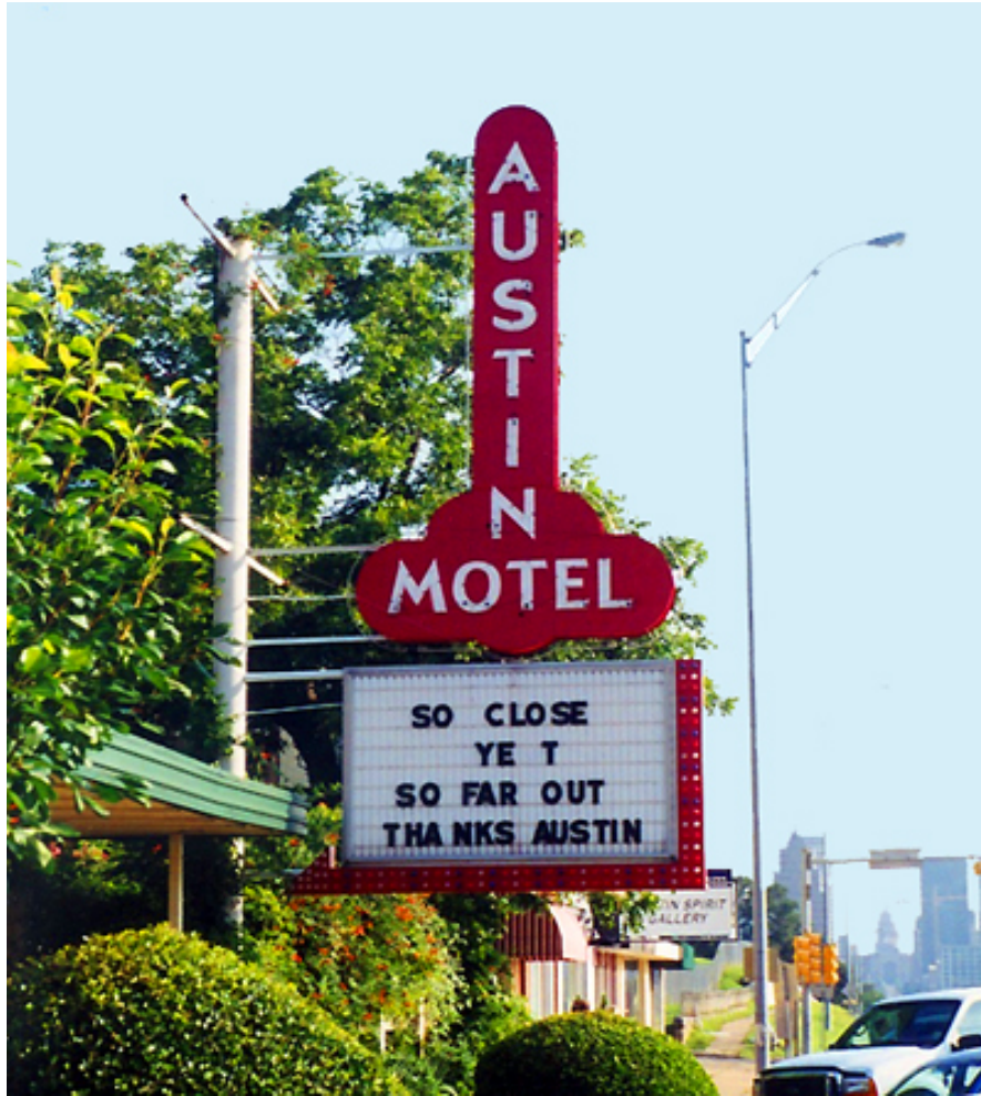
Figure 6: Austin Motel sign photographed in 2013.