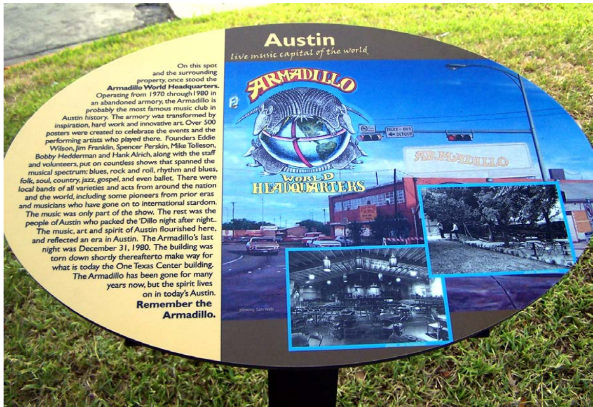
Figure 5: 2006 Commemorative plaque at the site of the Armadillo World Headquarters.

Unfortunately, many of the physical remnants in the built environment related to the psychedelic and progressive country music scenes either no longer exist or have been repurposed. The Vulcan Gas Company shut down in 1970, however, the physical structure is intact and is in use today as the present location of a clothing store, but the cultural value of its music history is difficult to physically preserve or commemorate without access to its original context. The building in which the Armadillo World Headquarters operated was demolished not long after the venue closed. A high-rise office building replaced the old National Guard armory. The only indicator of the site's history is a small commemorative plaque, dedicated by the City of Austin in 2006, where the iconic venue once stood. Ten years after its dedication, the plaque is faded, unmaintained, and yellowed from sun exposure.