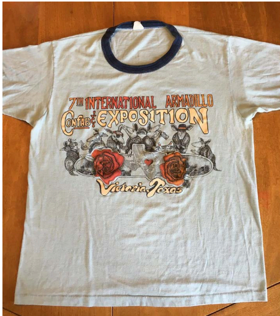
Figure 3: T-shirt from the 1976 International Armadillo Confab and Exposition in Victoria, Texas.

including country, rock, and German polka and, of course, the festival offered patrons a wealth of cold beer.