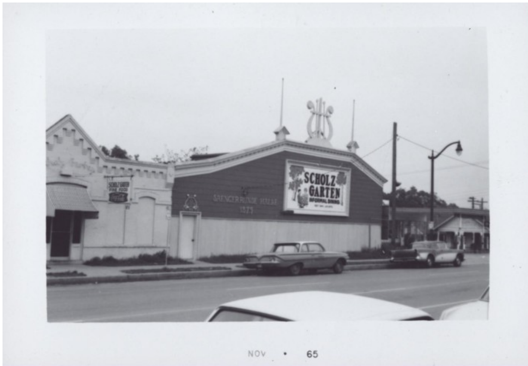
Figure 1: Scholz Garten photographed in 1965.

through “German schools, newspapers, sports clubs, agricultural cooperatives, and literary and arts organizations.” 20