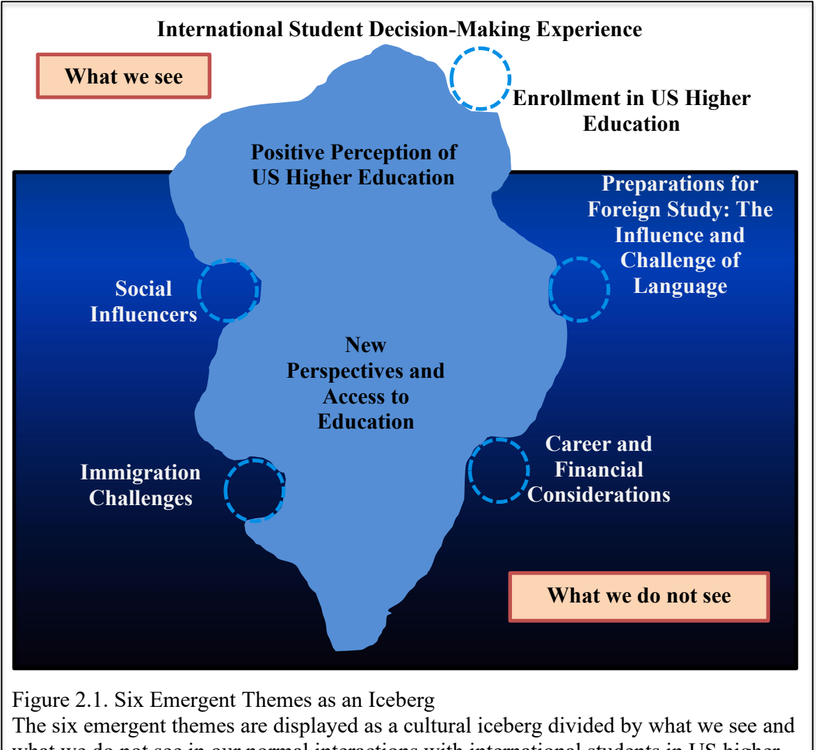
what we do not see in our normal interactions with international students in US higher education.

Overall, the common experience of the nine participants was one full of constant challenges buttressed by strong resiliency. Their experiences, explained by their direct quotes and stories, are highlighted throughout the six themes that will be discussed. What was most surprising about the data was the absence of many positive descriptions for their decision-making experiences. Instead of many positive expressions, respondents described their experiences as full of stress, difficult conversations, persuasion, tight schedules, challenging situations, and discouragement. Overall, the struggles