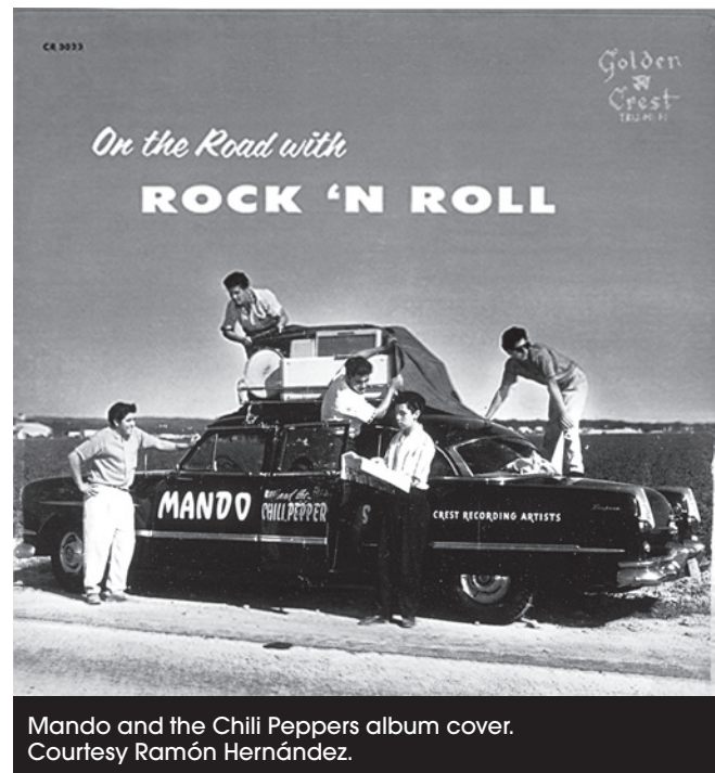
Mando and the Chili Peppers album cover.

In order to better understand how Texas-Mexican music reflects this process of selective assimilation within Mexican-American society, it is important to consider two different