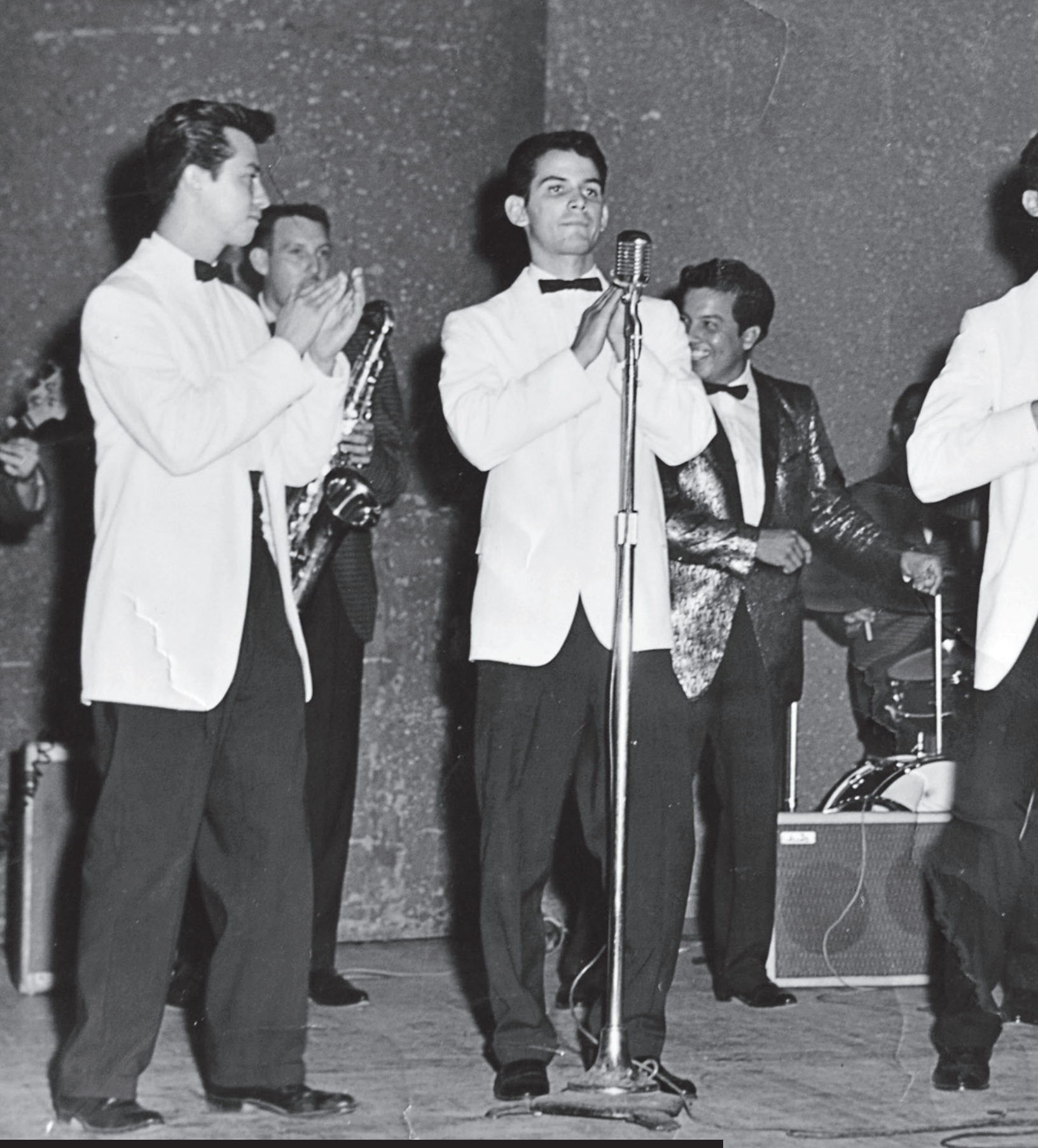
The Twisters (background) playing behind the Royal Jesters, ca 1958.