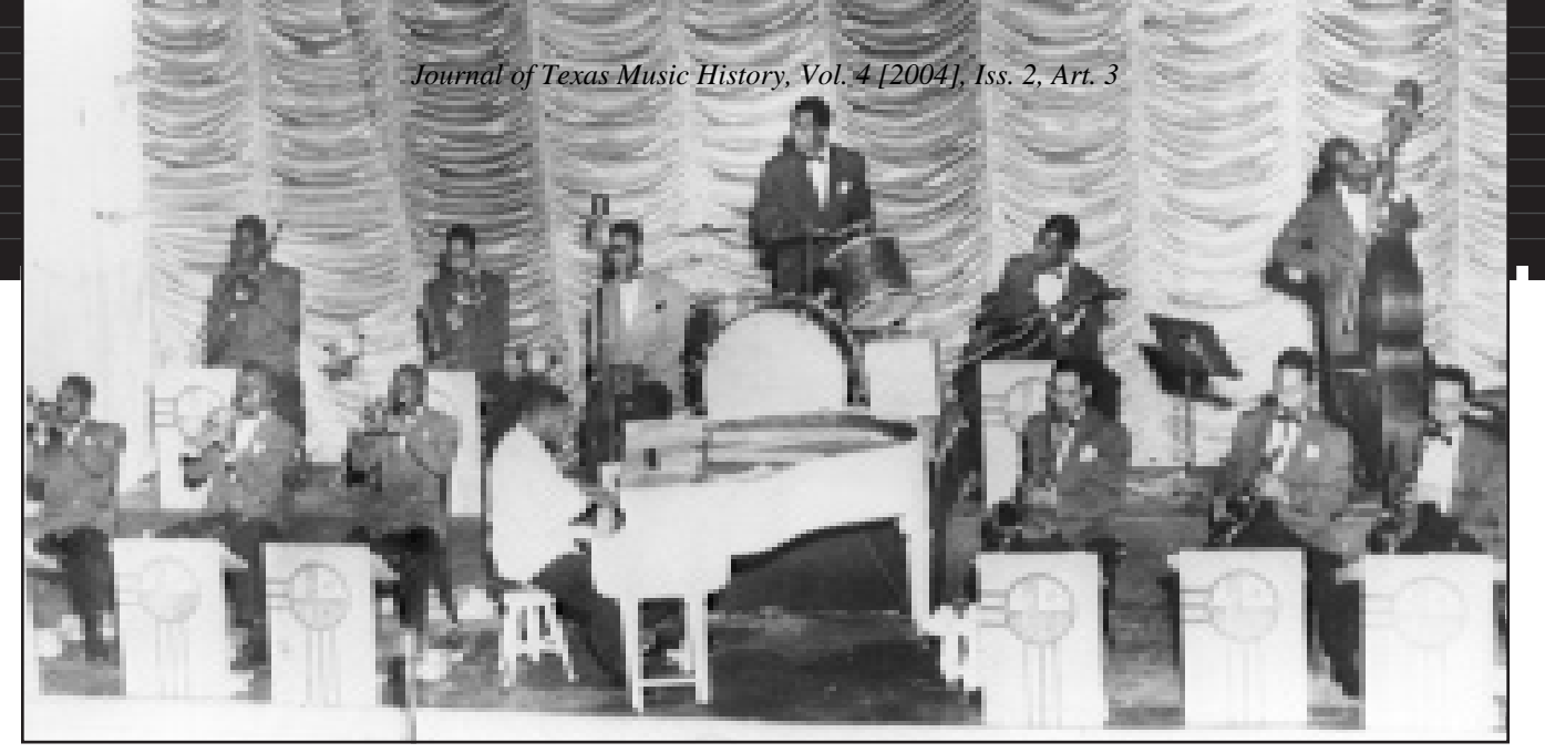
Woody Herman, courtesy of Storyville Records.