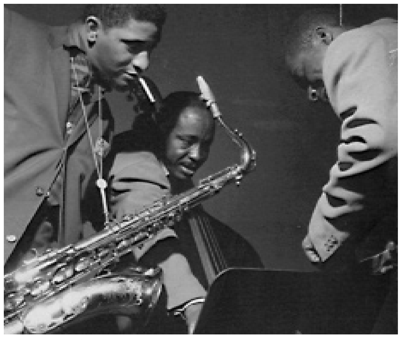
Woody Herman, courtesy of Storyville Records.

the black American people, in the search of something from the heart, have not introduced any extensions of the movement that have been too intellectual. In my opinion, in order to survive, jazz must stay an art of the people.<sup>91</sup>