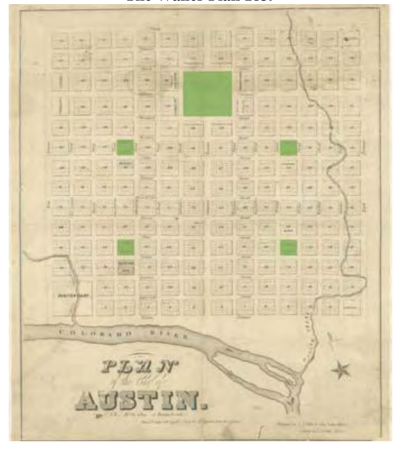
Figure 3.1 The Waller Plan 1839

Source: Map produced for The Waller Plan of 1839<sup>32</sup>