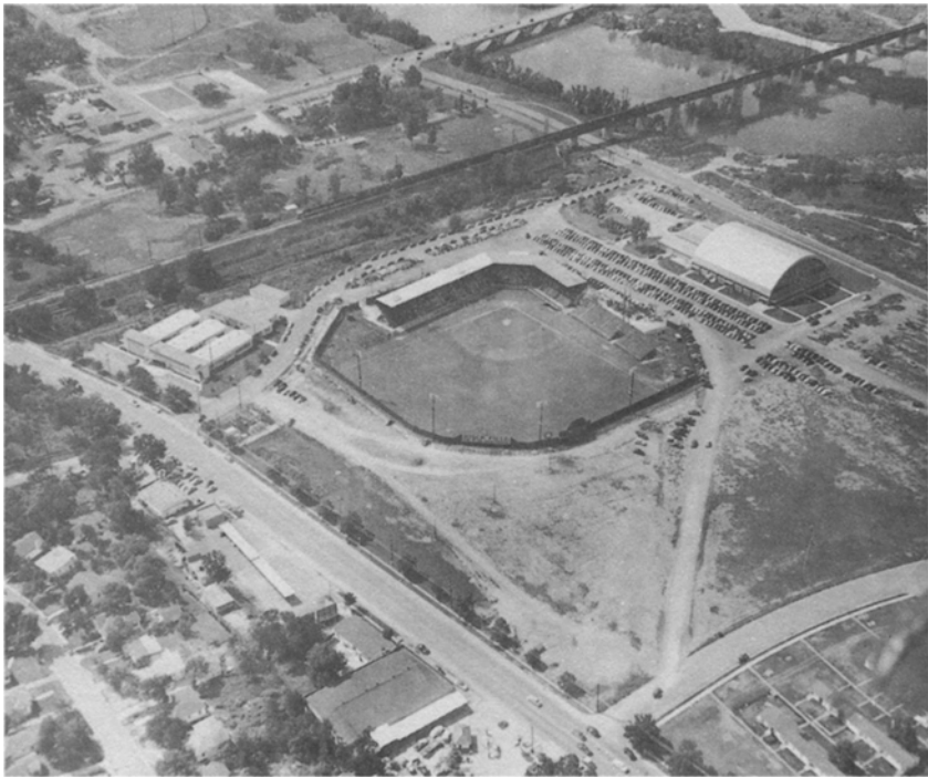
Aerial photograph of Disch Field.