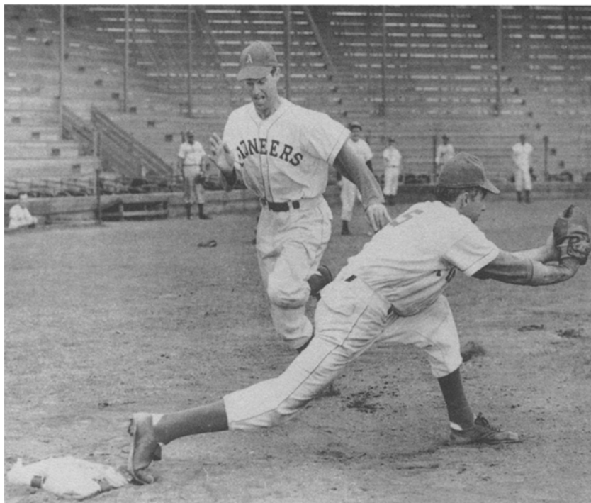
Austin Pioneer baseman stretches for a throw during a practice game.