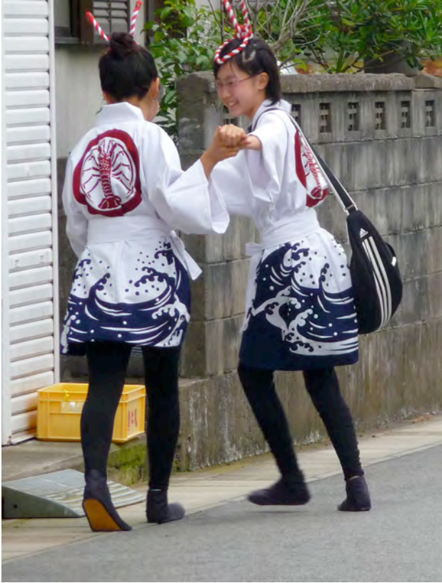
Festival Friends