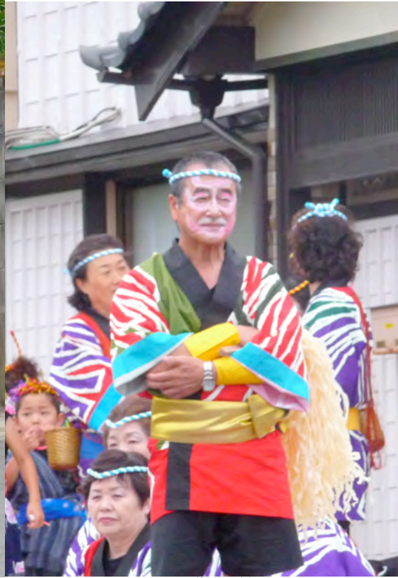
Hamajima Pride