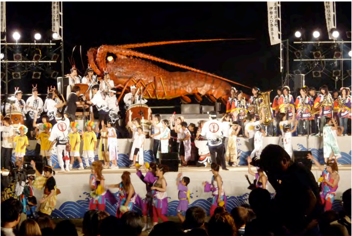
Jakoppe Finale