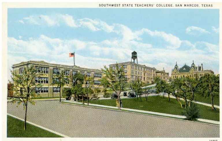
Early postcard of the quad, with the new Education Building on the left

Various agreements between the city of San Marcos and the college allowed for elementary and secondary school students to