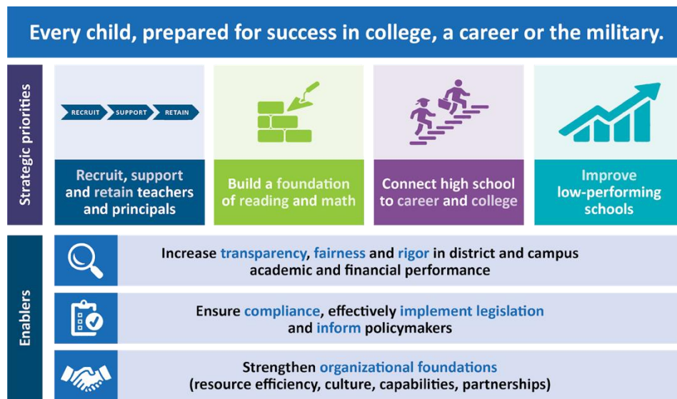
Figure 1. Texas Strategic Plan.

This call for support is evidenced in the five-year Strategic Priorities for Texas (see Figure 1).