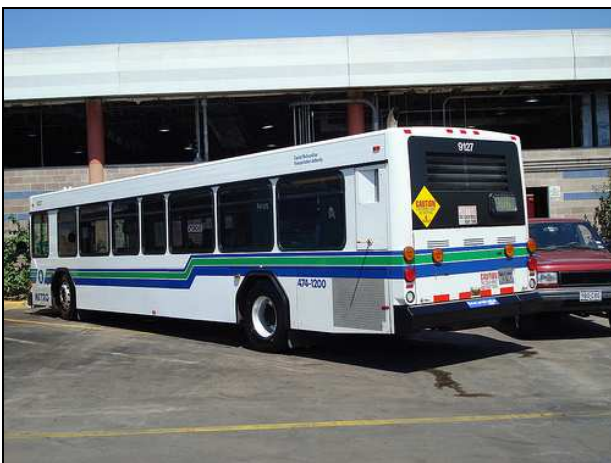
Figure 1.1 Capital Metro passenger bus

Capital Metropolitan Transportation Authority (Capital Metro) is the public transit system currently serving the greater metropolitan area of Austin, Texas. Capital Metros' life story begins on January 19, 1985, when voters in Austin and the surrounding area approved the creation of the Capital Metropolitan Transportation Authority. The voters agreed that the communities would support the agency with the proceeds from a one percent sales tax. Voters in that 1985 election also approved a service plan that expanded the existing Austin city bus service and called for the development of a light rail transportation system to serve the area. Figure 1.1 depicts Capital Metro bus in front of the 2910 East 5 th office building in Austin Texas.