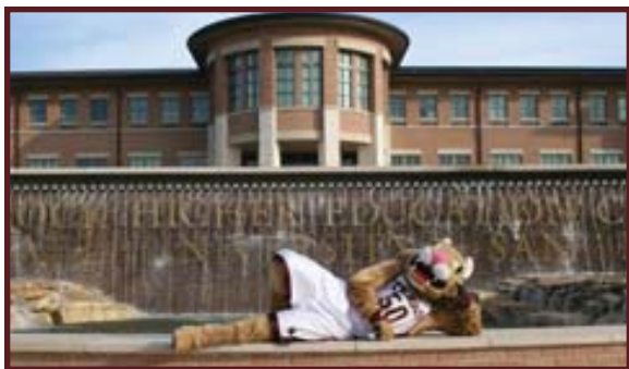
Boko visits the Round Rock Higher Education Center.