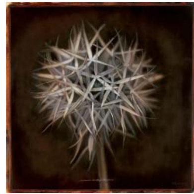
Microseris , 2006, by Kate Breakey is a 32" x 32" silver-gelatin photograph hand colored with oils and pencils. The artist's paint can be seen around the edges of this unframed print.