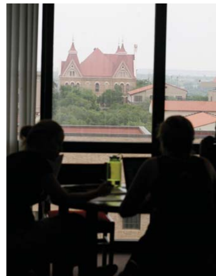
View of Old Main from the 7th floor of the Alkek Library