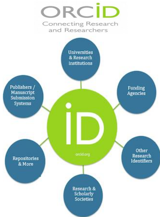
Figure 4: ORCID as Hub Connecting a Researchers Cognitive Landscape. Texas State University ORCID Research Guide: https://guides.library.txstate.edu/researcherprofile/orcid

With the proliferation of researchers globally, any digital research ecosystem would do well to utilize a ‘Researcher Identity Management System’ to connect and disambiguate scholars’ names. These systems disambiguate common researchers’ names such as James Smith, Maria Hernandez, Mustafa Abad or Zhang Wei. That is, the system differentiates the work of James Smith, the MD, from the astrophysicist, James Smith, or the scholarly work of the botanist, Maria Hernandez, from the biochemist, Maria Hernandez. Both may have extensive lists of journal publications. An online ‘Research Identity Management System’ gives a researcher a contributor ID, a unique number, so that all publications from a single researcher can