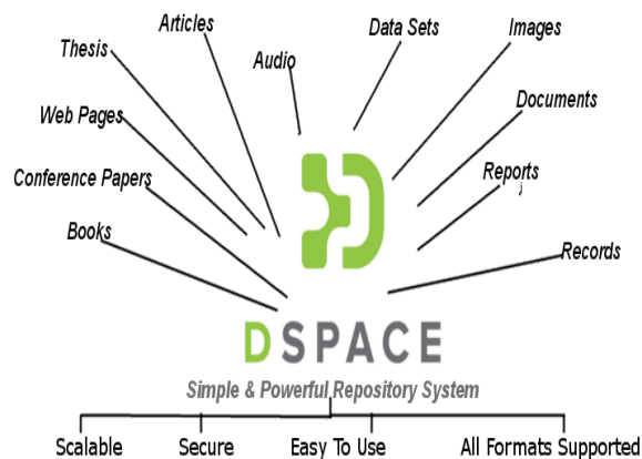
Figure 3: DSPACE Media Formats. Texas State Digital Collections Repository: https://digital.library.txstate.edu/

An online digital collections repository is a digital infrastructure which provides open access to scholarship and research produced by a university, college or research institution. A digital repository organizes, centralizes, preserves and makes accessible research and knowledge generated by the institution's research community. The application centers on text-based media artifacts including preprints, faculty publication, white papers, conference presentations, graduate student theses and dissertations. Research centers within an institution such as Specialized Research Groups/Centers, Special Collections and University Archives may also avail themselves of an institutional repository's possibilities [3]. This digital collection repository gives open web-centric visibility to the institution's research output and opens the institution to the possibilities of a global scholarly networked environment. Texas State University Digital Collections Repository [4] reconfigures the originally MIT-developed open-source product, D-SPACE [5].