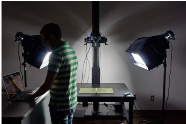
Figure 9: Texas State University Digitization Lab: https://www.library.txstate.edu/about/departments/dws.html

As university faculty, departmental and research center projects become more complex, specialized digitization equipment and staff facilitation will be needed. This ranges from more robust photographic digitization equipment to audio and video digitization equipment to high volume scanning equipment. A digitization lab will also be useful for historical analog media formats. This ranges from archival manuscript digitization and various textual documents to previous era's audio and video formats and larger project, more rapid text and image digitization needs (i.e. rapid text and slide scanners, large format newspaper scanners, etc.). While a full discussion of this hardware is beyond this paper's scope, an overview of basic types of basic equipment needed and further links to projects possible is provided on the Texas State Digital and Web Services Site [22].