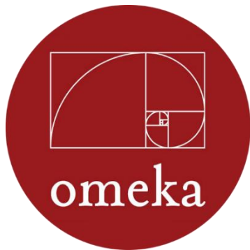
Figure 7: OMEKA S, next generation Web publishing Platform. https://omeka.org/s/

As digital projects become more demanding and specialized, user interface software becomes a requirement to provide both an elegant portal or gateway entrance to specialized research projects and a necessary middleware to seamlessly connect the various software and media components mentioned above. For raising the quality of online exhibitions to research portals utilizing the digital and data repositories, Texas State University Libraries uses OMEKA [14].