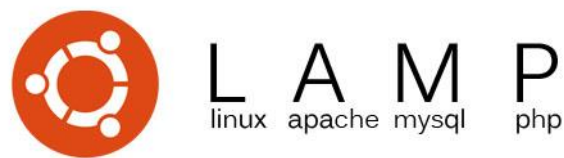
Figure 11: LAMP open source server set up, archetypal model of web server stacks.

As with any larger IT project, dedicated human resources will be needed. It is best to develop such project teams so that there is a partnership between the university's libraries and the university's IT division. A system administrator will be needed to set up the open-source server infrastructure (i.e. LAMP: Linux, Apache, MySQL, PHP and Microsoft) for software beginning with the institutional repository unless hosted options are pursued [24].